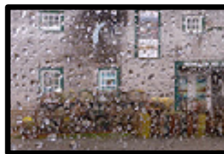
"Rainy Day in Newfoundland" 1st pl color print by Andi Sahlen