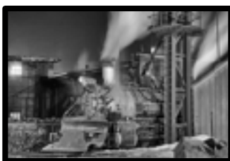
"Getting the Engine Ready" by Gary Rich (digital Mono)