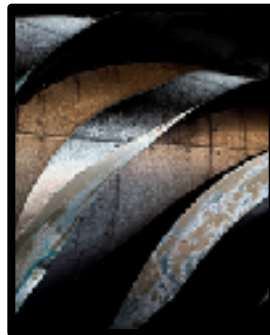
"Twisted " By Sandy Rich (digital color)

agrimes1923@gmail .com. Website auroraphotoclub.org